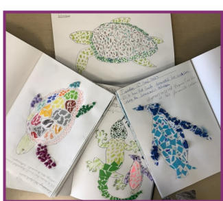
In Willow class, we have been learning about the expansion of the Roman Empire.